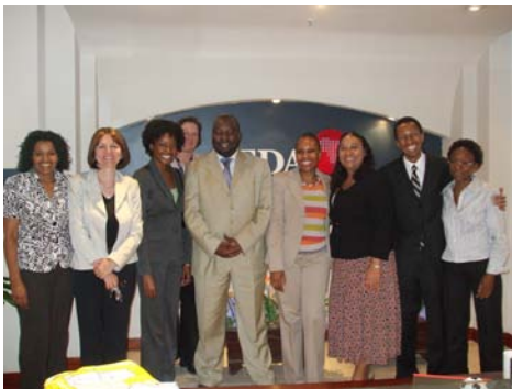
USKCC Trade Mission Delegates at the Gauteng Economic Development Agency - 2008