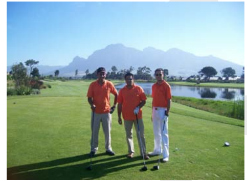
South African Department of Trade and Industry Golf Outing, Cape Town, South Africa

South Africa (The Rainbow Nation) is Africa's largest and most sophisticated economy, a burgeoning democracy, home to nationals of every country on the African continent, an economic powerhouse with the most complex and highly diversified financial systems in Africa. It boasts world-class academic institutions and technical and scientific marvels from the first heart transplant, the successful separation of Siamese twins to the development and deployment of globally commercialized software applications such as PayPal. South Africa is a vibrant emerging market with superior performance in a myriad of sectors including mining (precious metals and minerals), capital markets, automotive manufacturing, agricultural exports, ICT, BPO and chemical production from fuel and plastics fabrication to pharmaceutical production. South Africa has engineered GDP growth of over 158% in the last 7 years with innovative economic development initiatives, sound governance, and bold political will to be the best in the world.